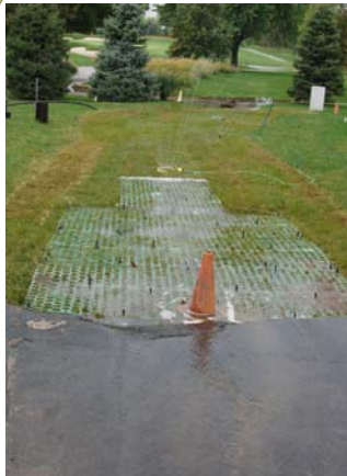
Vegetated drainage way able to exceed 15 lbs/ft2 shear stress.