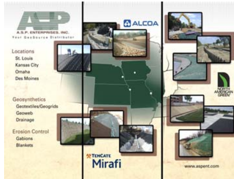
New Booth Graphic

Skyline Exhibits was hired to create a new background format utilizing a newer technology. We also procured a booth table that according to a few of our salesman, looks capable of becoming a beer tapper. While it adds to the already great new look, it unfortunately does not come equipped with a refrigeration unit. We are looking forward to seeing you at an upcoming trade show including our own ASP "Clean & Green" Sustainability Conference and Expo, April 28th-30th . See our insert for more information.