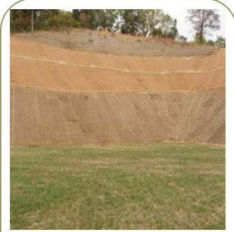
2:1, 150' long slope was broken up with straw wattles and protected with C125 and SC250. Even after heavy winter rains, no significant erosion took place.