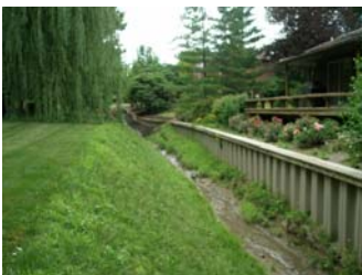
6 months later, the wall has blended in to the landscape.