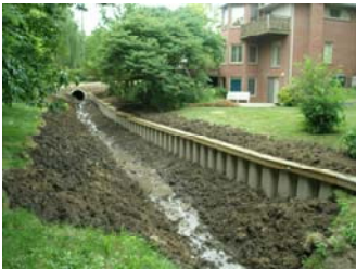
Completion of Vinyl Sheet Pile wall.