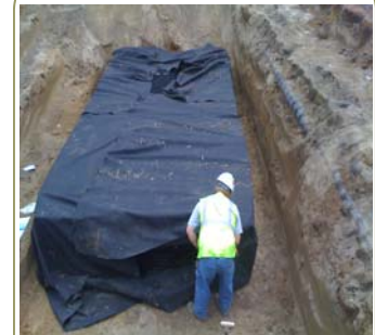
After wrapping the entire tank system in geotextile, piping was attached and the whole system backfilled, compacted and paved.