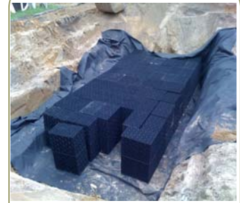
Infiltration tanks being installed under a geotextile layer. This 2500 gallon storage volume was installed in one day with a crew of 4.