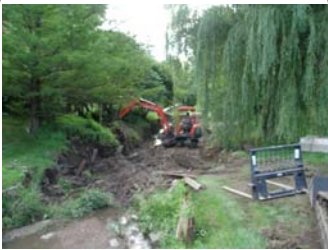
Demolition of existing tie wall.

Project name: Schulte Creek Bank Repair Project location: Auburn Nebraska Products incorporated: CMI-Crane Material Intl. Vinyl Sheet Piling-Shoreguard S325 Purpose of project: Stabilize eroded creek banks Previous repair attempt: Railroad Ties